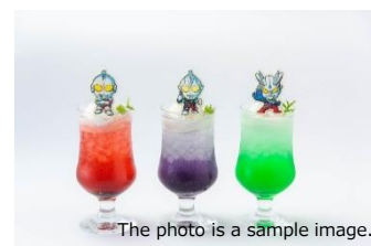
Image of the themed cafe menu