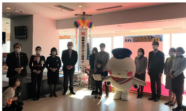
(Photo of the ceremony to celebrate reaching forty million passengers)

Sponsors: Skymark Airlines Inc., ALL NIPPON AIRWAYS CO., LTD., Solaseed Air Inc., AIRDO Co., Ltd., Fuji Dream Airlines Co., Ltd. (in no particular order)