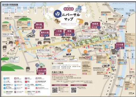
Kinokuni-ji Onsen in Hyogo Prefecture