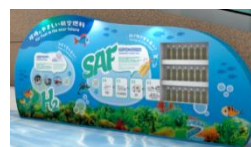
Introduction of the future aviation energy