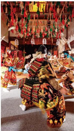
Iwami Kagura in Shimane Prefecture