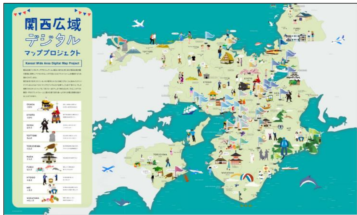
Kansai wide area digital map "Dig the LOCAL in KANSAI"

The Kansai wide area digital map allows travelers in Kansai to easily access sightseeing information for the 10 prefectures in Kansai. The illustrated map, full of originality, showcases the charm of each place throughout Kansai, providing travelers with even more sightseeing information!