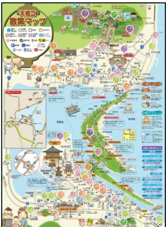
Amanohashidate in Kyoto Prefecture