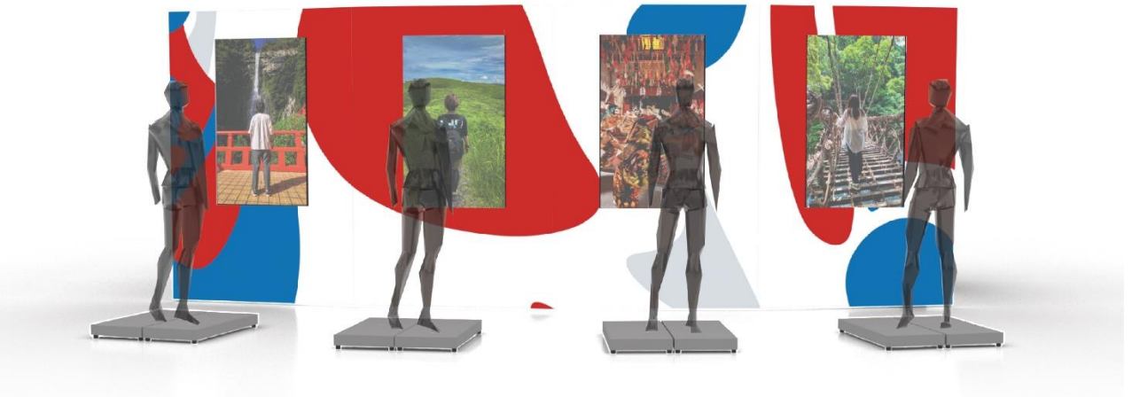
Examples of virtual sightseeing