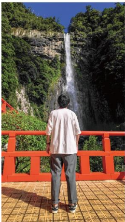
Nachikatsuura in Wakayama Prefecture