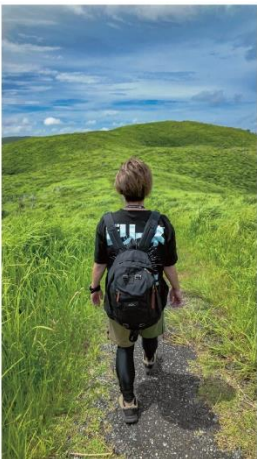
Akiyoshidai in Yamaguchi Prefecture