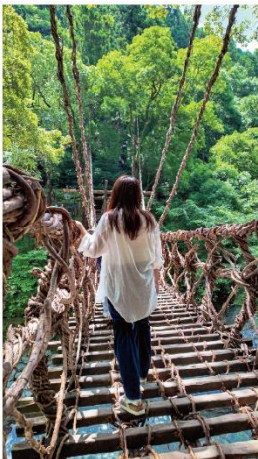
Kazurabashi in Tokushima Prefecture