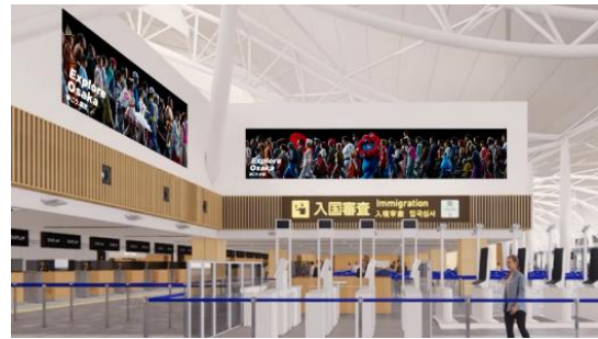
KIX T1 immigration area (from next spring)