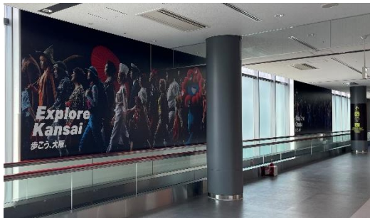
KIX T1 domestic area