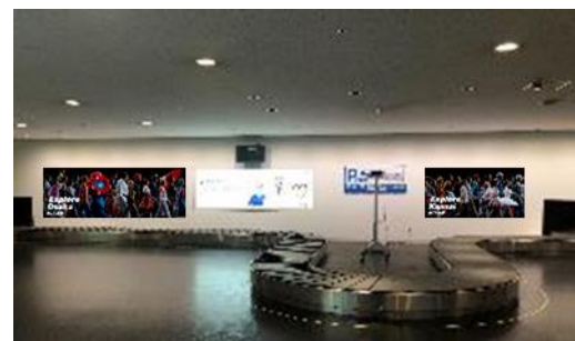
KOBE 1F baggage claim area