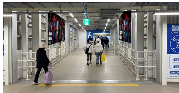
KIX T2 international arrival concourse (from August-end)