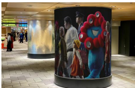
ITAMI 2F arrival area in the central (from August-end)