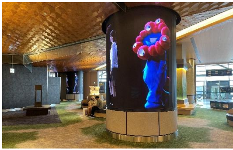
KIX T1 international departure area

URL: https://www.kansai-airport.or.jp/en/expo2025