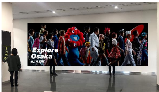
ITAMI North Terminal Arrivals Concourse (from August-end)