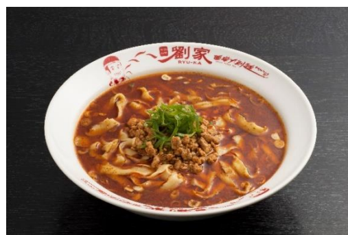
Signature Seian Spicy Tushomen