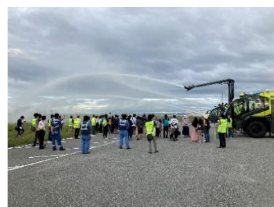
Runway walk in 2022