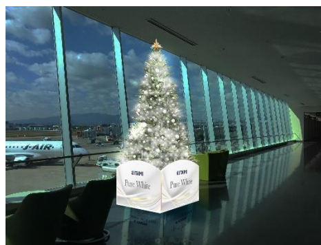
Corridor connecting north and south boarding