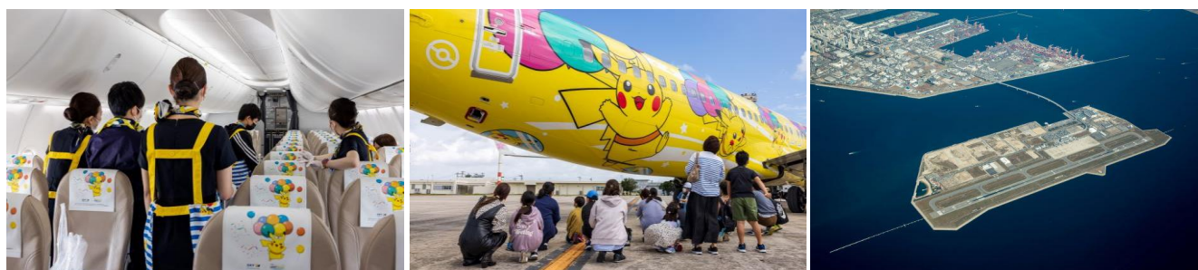
Kobe Airport

*Airplane without the Pikachu paint may be used, or the flight route may change without prior notice due to inclement weather, aircraft arrangement and other factors.