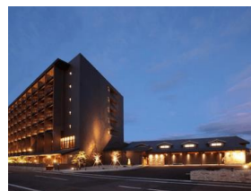
Special prize: Free night tickets at Hotel Banso of Yunokawa Onsen in Hakodate (1 night w/ two dinner: ¥50,000 equivalent)