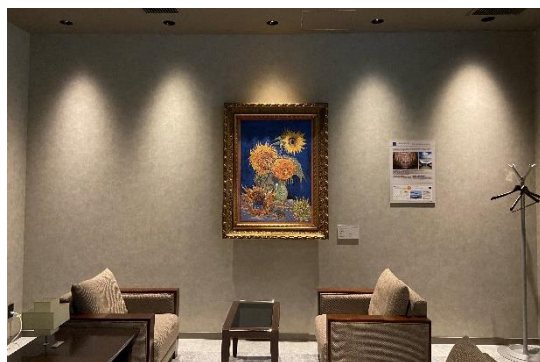
The phantasmal “Sunflowers” destroyed by fire in Ashiya City, Hyogo Prefecture in 1945.