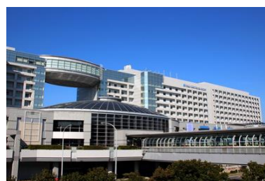
A prize: Hotel Nikko Kansai Airport voucher (worth 20,000 yen)