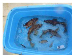
Sorting and measuring