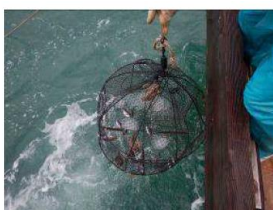
Picking up the fish basket