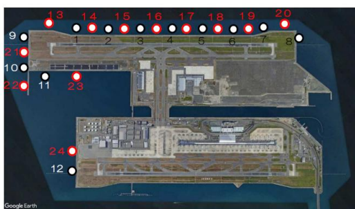
○○: Locations of fish basket (12 locations per survey)