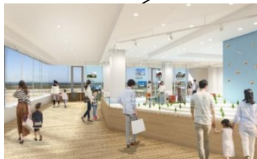
Exhibition Room 2 Miniature world resembling Kobe's landscapes