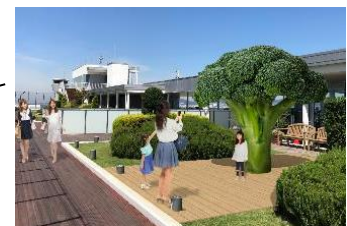
Giant broccoli object