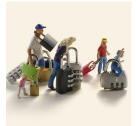
Examples of works