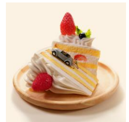
Examples of works

* Renderings and images for illustration purposes only