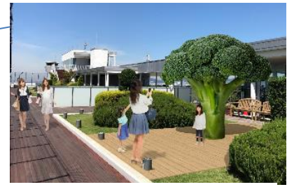
Giant broccoli object