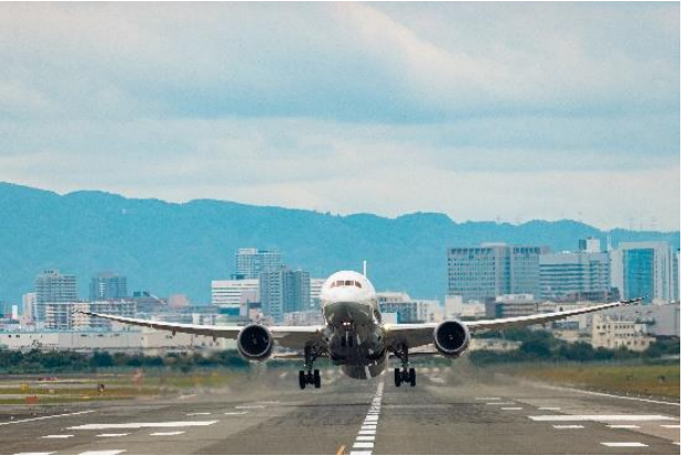
Runway of Osaka International Airport

Kansai Airports Group plans to deliver attractive information of the airports and travel to many people through exciting campaigns.