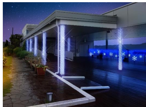
Top left: Christmas tree and Sorayan illumination Others: Lights featuring snowflakes on rooftop observation deck