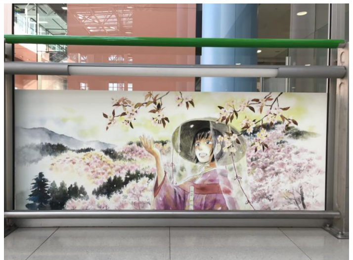
Pilgrim Way (Kii Peninsula)