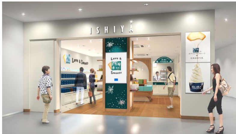
*For illustration purposes only

Kansai Airports continues to develop fun and exciting shops and restaurants at the airports to provide our customers with an enjoyable and comfortable travel experience.