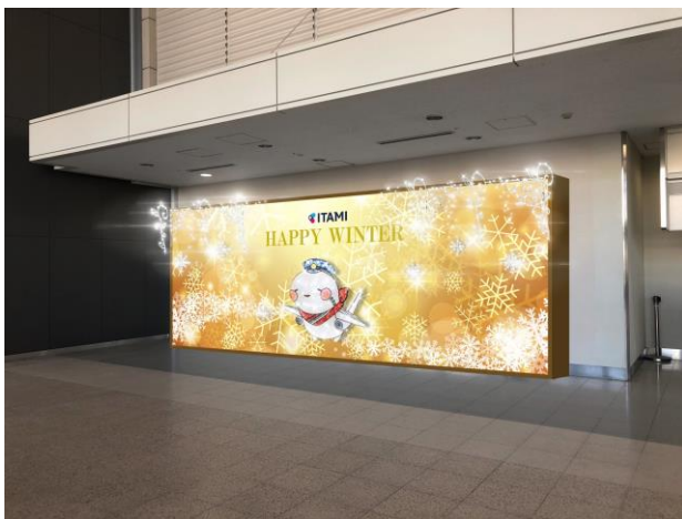
North terminal, Level 1