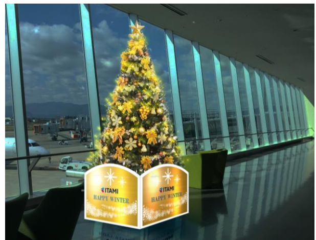
Concourse connecting north & south boarding gates