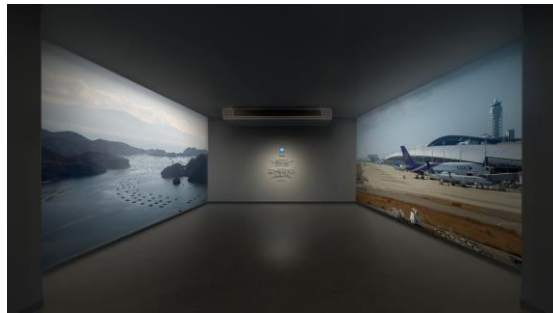
Rhizomatiks Research Daito Manabe’s phase (south arrival path)