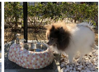
Pee pole with washing functions