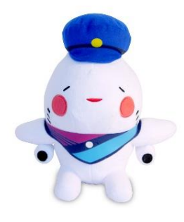
Stuffed toy 1,800 yen (excl. tax) Sorayan has morphed into a cute stuffed toy wearing a scarf specially designed for the 25th anniversary of KIX.