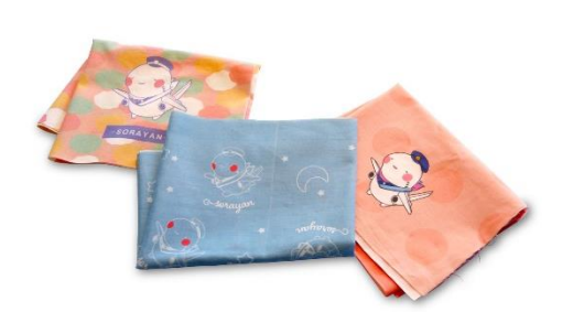
Hand towel 650 yen (excl. tax) The hand towel comes in three designs. The soft-colored towel can be used for various scenes.