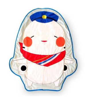
Blanket 2,000 yen (excl. tax) The Sorayan-shaped blanket is perfect for chilly days and nights. Keep yourself warm at home or in office.