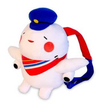
<u>Backpack</u> 2,700 yen (excl. tax) Kids can now travel with Sorayan wherever they go.

This time, to commemorate the 25th, 80th and 13th anniversaries of KIX, ITAMI and KOBE, new Sorayan items will be offered, including backpacks, stuffed toys, hand towels and blankets. Notebooks featuring each airport will also be available in the Sky View observation hall at KIX.