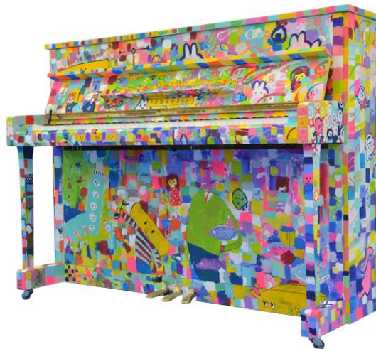
Colorfully painted YAMAHA's upright "LovePiano"

Kansai Airports is excited to announce that YAMAHA's "LovePiano" will be set up at Osaka International Airport (ITAMI) for the first time in any airport. This piano will be free to be played by any passerby at the airport for four days between April 18 and 21, 2019. Prior to that, airport guests will be able to catch a glimpse of the colorfully painted piano on display in front of DEAN&DELUCA CAFE on Level 3 of Central Block from April 13 to 17, 2019.