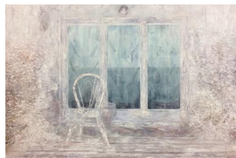
Some artworks to be displayed