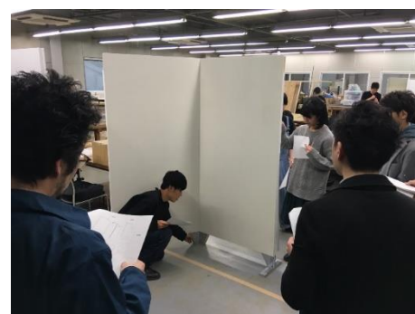
Students working on art

For the very first exhibition, about 50 students from five universities in Kansai will create artworks around the theme "Airport". A collection of 85 art pieces of different genres; traditional Japanese paintings, woodblocks, textiles, video art on digital signage, furniture, etc. will welcome you to ITAMI Airport and give you a brand-new perspective on an airport.