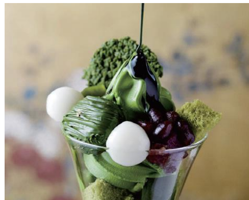
*The images are for illustration purpose only.