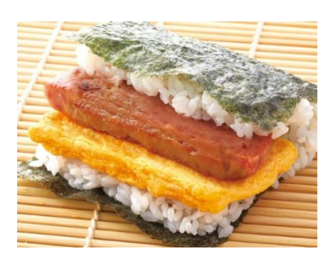
Pork & egg rice sandwich