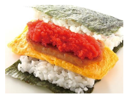
Pork & egg & spicy cod roe rice sandwich