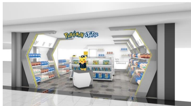
The image is for illustration purposes only.

Location: Restaurant & shop floor, Level 3, Terminal 1