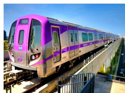
Express train (Taoyuan Metro)