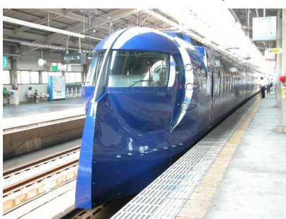
Limited Express rapid (Nankai Electric Railway)

Maximizing the synergy effect generated through the partnership, we will continuously work to implement joint promotions and projects using the tools of the four companies. We will also seek to expand Japan-Taiwan exchanges by capitalizing on both airports as well as sightseeing spots along the rail routes, which we hope will boost travelers between the two countries.