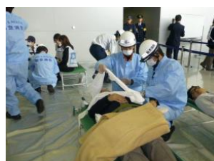
Rescue drills for injured people