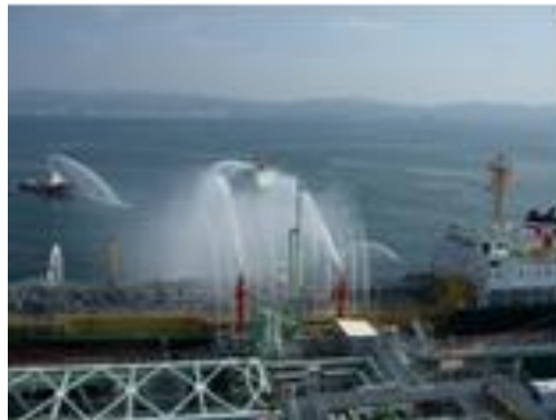
Fire extinguishing training