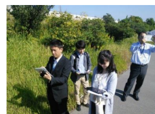
Evacuating to Phase II Island using AR app