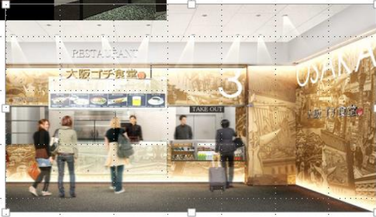
International restricted area restaurant Osaka Gochi Shokudo