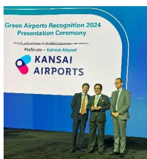
At the ceremony

It is one of the organizations of ACI (Airports Council International). Representing 131 members operating 617 airports in 49 countries and territories in Asia and the Middle East, this international organization, headquartered in Hong Kong, provides a variety of information on standards and policies for airports.