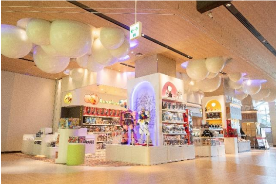
Mood area: FUN