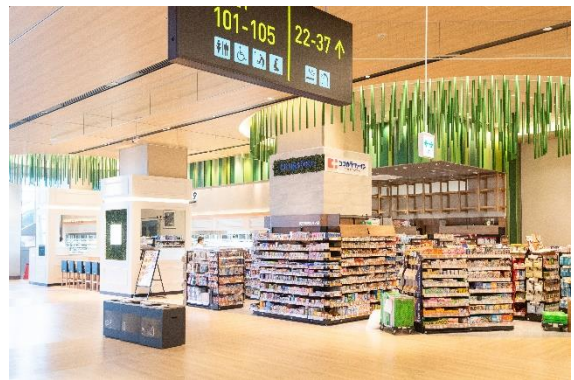
Mood area: PEACEFUL