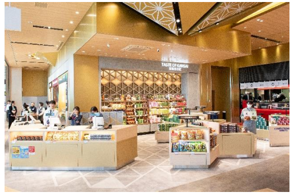
Mood area: CURIOUS