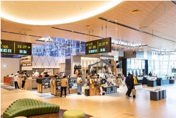
Mood area: ACTIVE