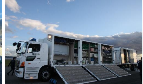
Transport of medical equipment

Contact Information Public Relations Group Corporate Communications Department TEL: +81-72-455-2201