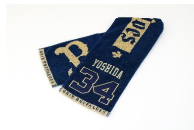
Player name & number long towel