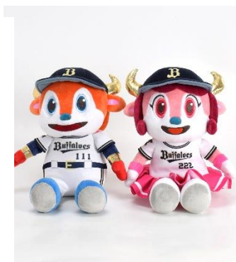
Mascot soft toys