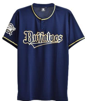
Player name & number henley shirt