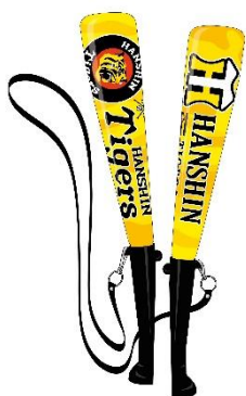
Mini baseball bat shape cheering sticks