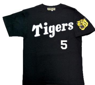
Player number T-shirt