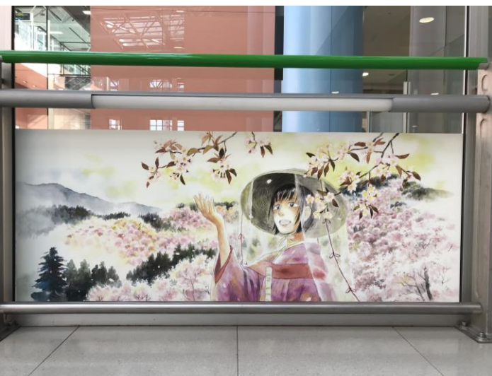
Pilgrim Way (Kii Peninsula)