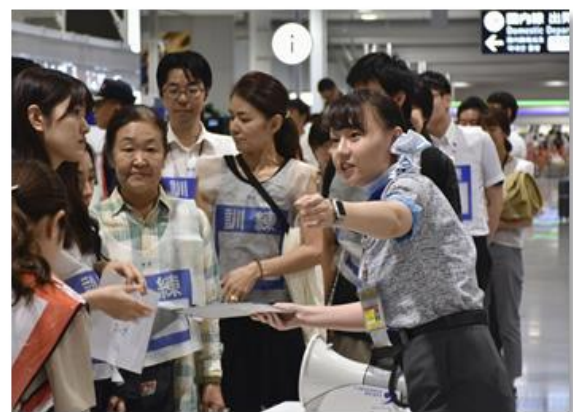
Last year's passenger assistance drill