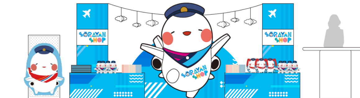
*The image is for illustration purpose only

Products: Backpacks, stuffed toys, hand towels and blankets