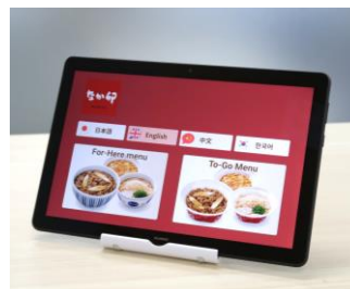
Touch panel terminal