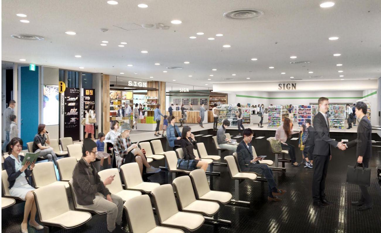
Arrival Lobby 1F