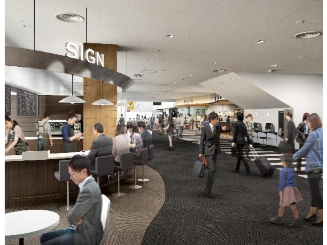
Waiting Space before Boarding 2F