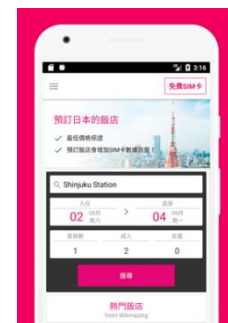
Image of App