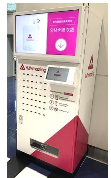
SIM Pickup Machine